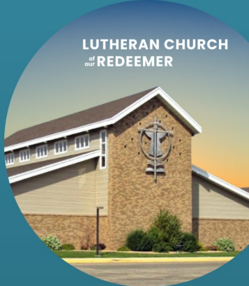
LUTHERAN CHURCH of REDEEMER

5:30 p.m. - Traditional Worship (Pastor led the first Saturday of each month; Lay led other times.)