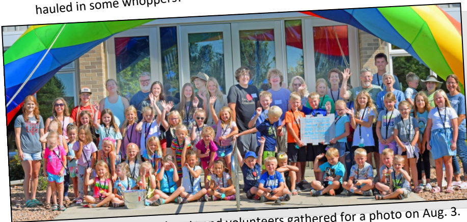
Vacation Bible School participants and volunteers gathered for a photo on Aug. 3.