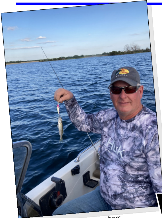
LCOOR Fishing League members hauled in some whoppers!

Vol. 30 • Issue No. 8 Lutheran Church of Our Redeemer • Watertown, S.D. September 2022