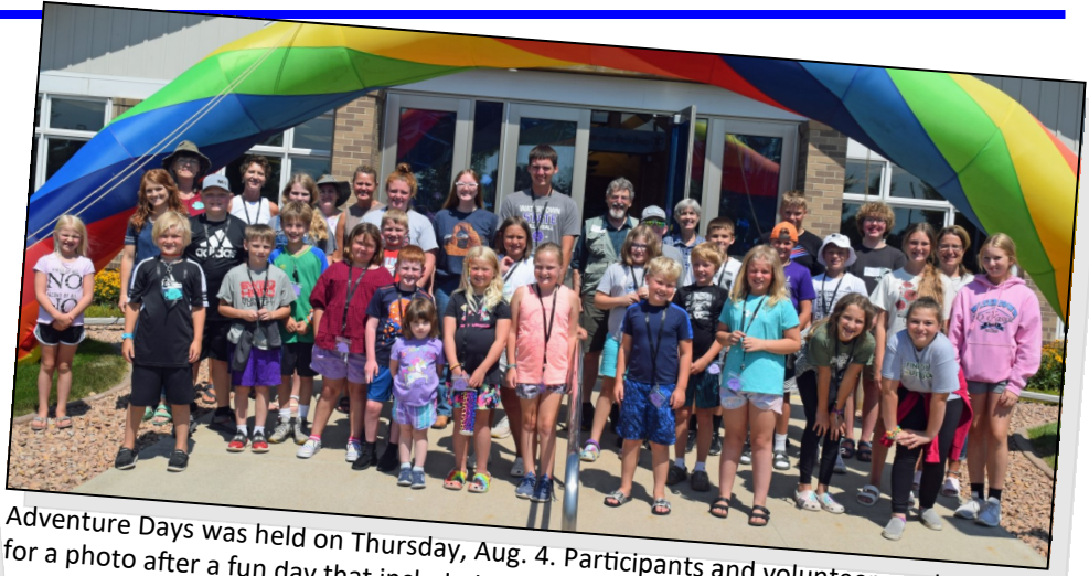
Adventure Days was held on Thursday, Aug. 4. Participants and volunteers gathered for a photo after a fun day that included a fishing trip!