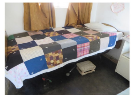
Burure Clinic, Zimbabwe

Global Health Ministries includes quilts whenever possible when shipping medical supplies and equipment to mission hospitals and clinics overseas. Quilts and blankets are carefully wrapped around precious medical equipment to help protect the equipment during shipping. Once the container arrives and the contents distributed, the quilts are given to the hospital for use with their patients, many of whom have no covering for comfort or warmth. Often the hospital encourages the patient to take the quilt with them when they go home, knowing it will probably be the family's only blanket. Because mission quilts sent by GHM are often used on hospital beds, twin-size quilts and blankets are the best size.