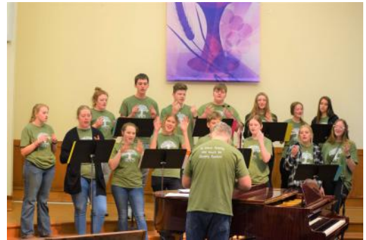
High School Lenten Youth Music Team