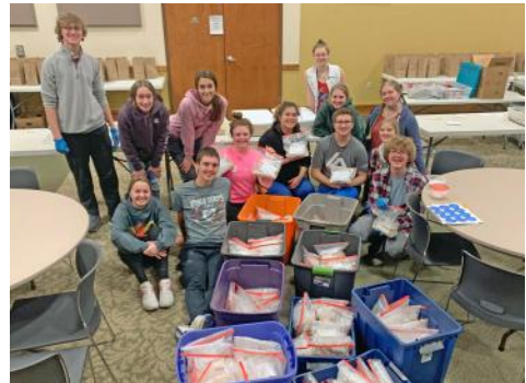
LCOOR youth assembling a variety of cookie kits for Sandwich Ministry

Throughout the year, the LCOOR congregation was also involved in outreach in the following areas: