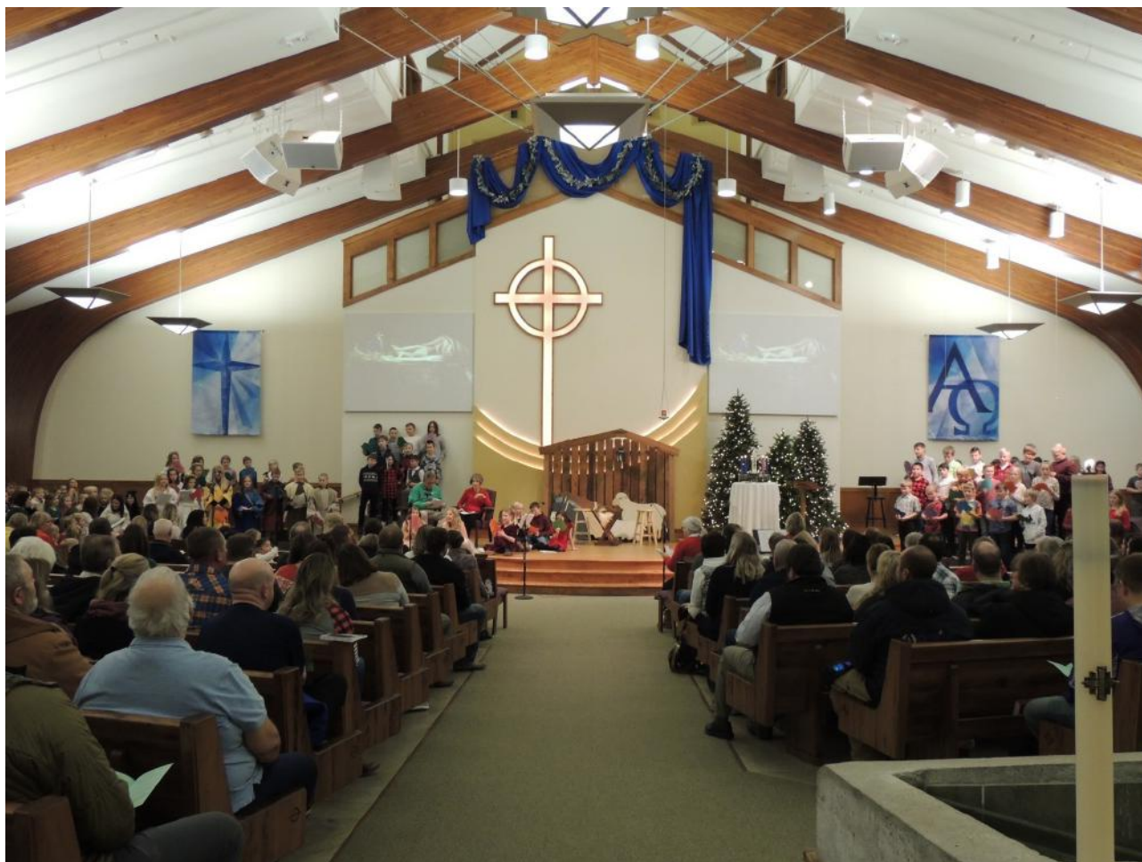
2022 Church School Christmas Program