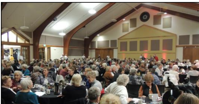
A wonderful turn out at Ladies Night Out

"Let your steadfast love, O Lord, be upon us, even as we hope in you." Psalm 33:22