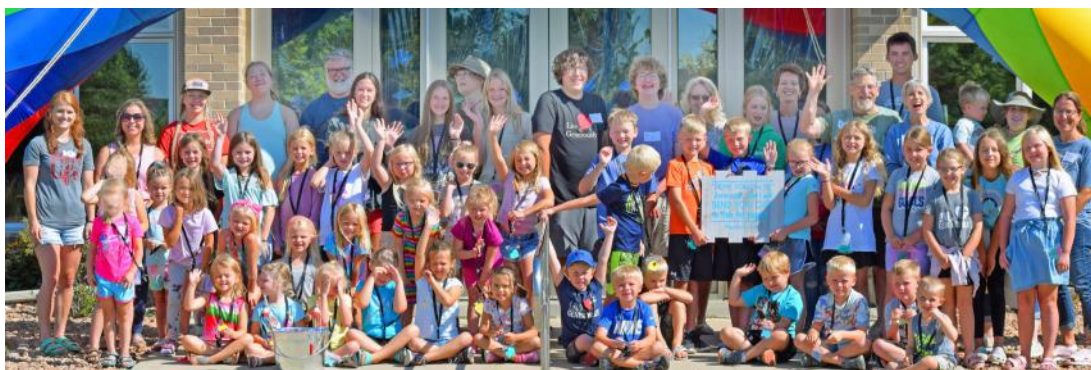
Vacation Bible School—Fishers of People