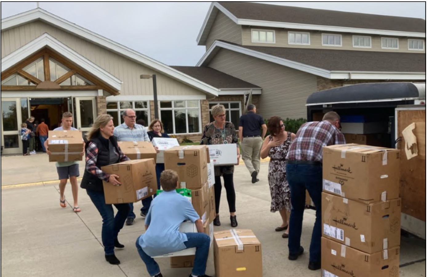
Members and friends loading the LWR boxes in the trailer