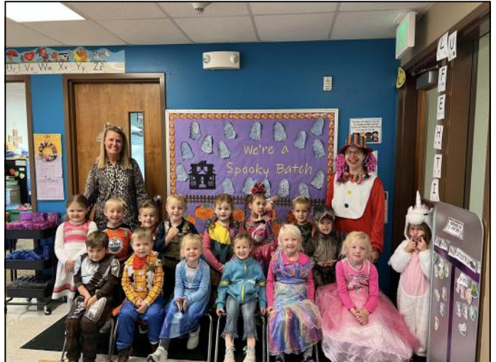
Halloween Fun at LCOOR Preschool

We were blessed to have 28 children enrolled in the Spring Semester (Jan.-May), and 26 children enrolled in the Fall Semester (Sept.-Dec.). The Pre-Kindergarten class meets on Monday-Thursday from 8:30-11:30am and 12:15-3:15pm. These classes are for 4 & 5 year olds. In September we raised tuition from $140 to $150/month and the enrollment fee from $30 to $50.