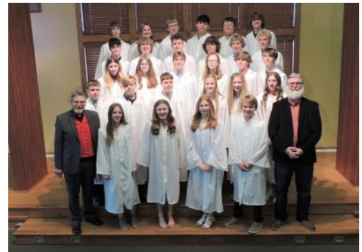
LCOOR’s 2022 Confirmation Class

As our youth and volunteers participated in the above ministry activities, the consistent goal was to provide fellowship, allow for the opportunity to serve others and to better understand how God is using each one of us within our community of faith and in the larger world. The youth program at LCOOR is open and affirming to all youth, striving to make all youth feel welcomed and loved! Thank you to the LCOOR community for providing the means to carry out this vision at the church and in the community.