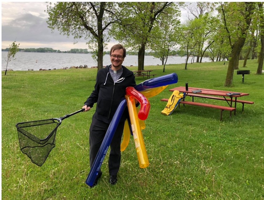
Safety Measures....6 feet apart.

Church staff will complete refresher trainings for CPR/First Aid and AED through the American Heart Association once it is safe again to do so.