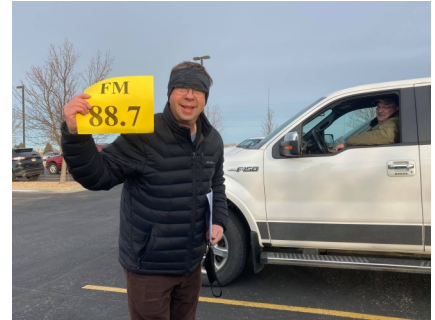
Parking Lot Caroling

The year 2020 has been a year, in all areas of our lives – and certainly in the church – of not knowing what will happen next. March 11 was the last worship service we held in the sanctuary due to the Coronavirus pandemic. We stopped in-person worship until late spring (details elsewhere in this annual report), when we began parking lot worship services.