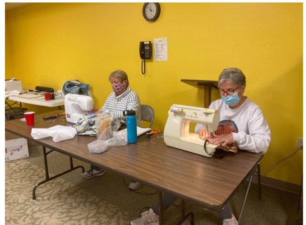
Sewing Hospice Gowns

Ongoing – Watertown Sandwich Ministry and Brothers & Sisters Behind Bars