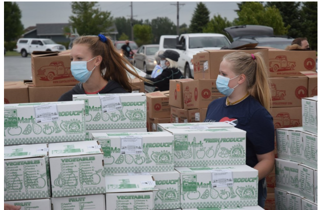
Food Distribution in the Parking Lot.

To summarize the year that had a lot of questions but provided a lot answers in the journey of our faith. It was easy sometimes and it was hard sometimes, and that's OK. It has been a pleasure serving these past three years. I hope 2021 finds another path of faith and I'm OK to leave 2020 in the mirror.