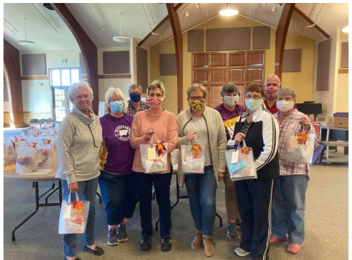
Fellowship Committee put together 75+ Goodie Bags.

Fellowship Committee – Instead of being defeated by the pandemic, this social group found new ways to bring joy in 2020. More than 125 gift bags were assembled and delivered to our 75+ members of the congregation in lieu of the annual Faithful Generations dinner. This event coincided with God's Work Our Hands...making delivery help possible! In November, the group hosted LCOOR's first "Advent Tour of Nativities," featuring nearly 100 Nativities belonging to members of the congregation. The six-time-event opened on the Friday after Thanksgiving and concluded on Dec. 6, 2020.