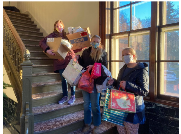
H.S. Youth gathering items for CASA “Stockings of Hope”