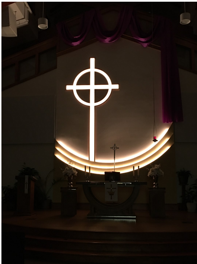
“Let It Shine” South Dakota