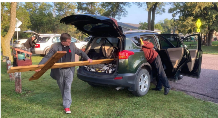
Preparing for Confirmation Worship at Memorial Park.

And there were so very many other ways we continued or changed the way we shone God’s light. May we continue to live the love of God in 2021 and beyond.