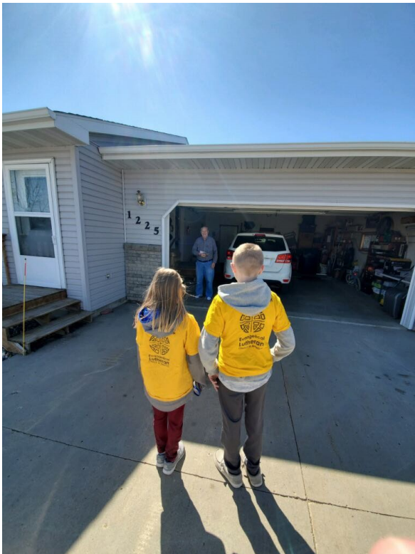
Keeping Connected through Drive-way Visits.