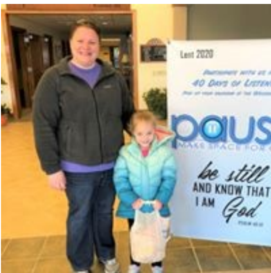
Cookie Bakers for Watertown Sandwich Ministry.

$475—Prairie Coteau Conference Women sending Quilts