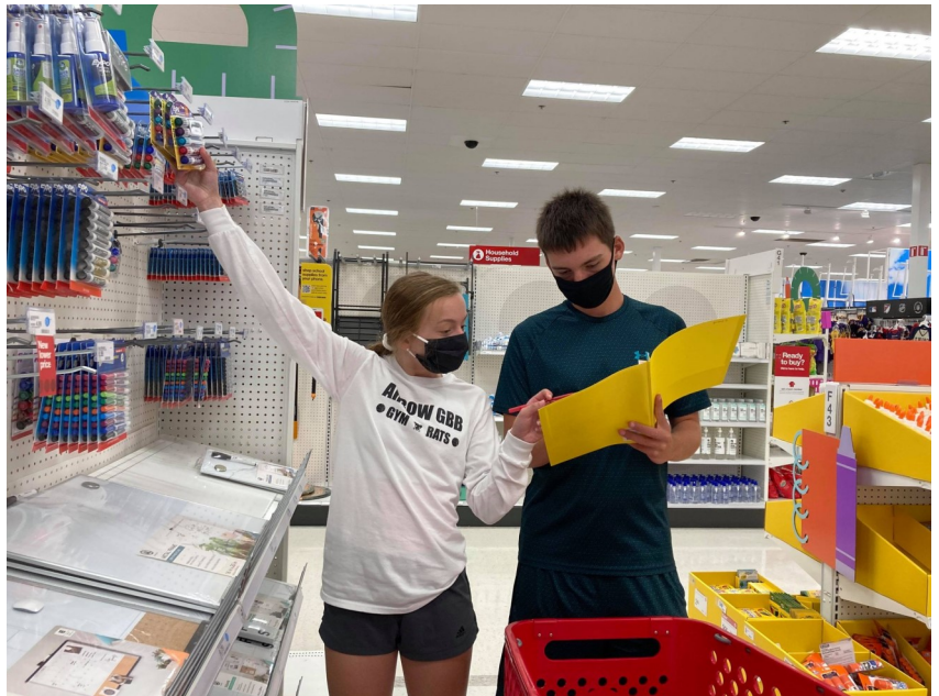
H.S. Youth shopping for CASA School Supplies.