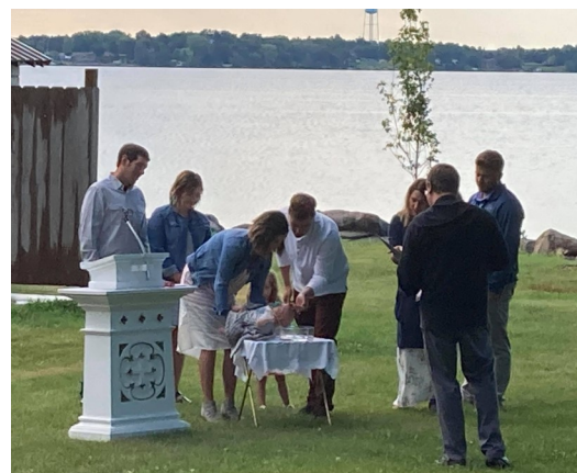
Baptism at Memorial Park Worship