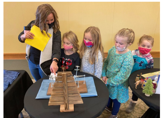
Church School Students tour the Nativities set up in the Great Hall.

Unfortunately VBS and Day Camp were cancelled this past summer due to Covid-19 concerns.