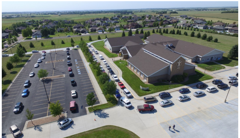
Parking Lot during the Food Distribution.