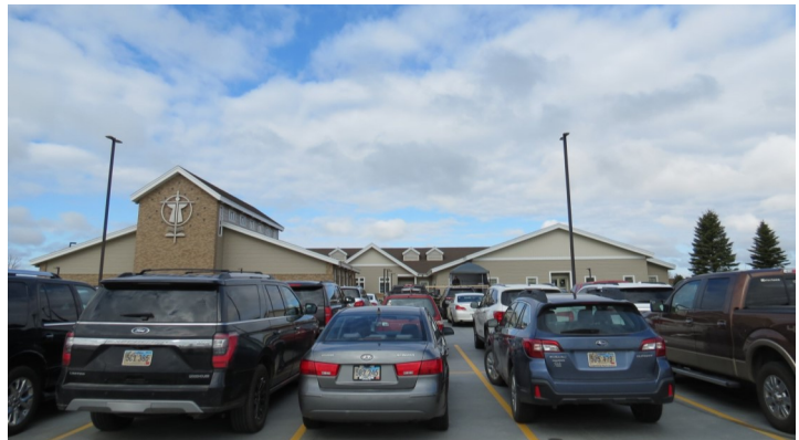
Parking Lot Worship