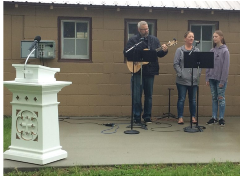
Worship at Memorial Park.

This was an interesting year for the Sound & Projection Team. When worship went on hiatus in March, so did the Sound & Projection Team members. Volunteers began serving in worship again at the end of June. Many of the volunteers had not worked with the sound and projection equipment or cameras for many months. With the addition of live streaming, this added an extra element to what is being required of these volunteers. Several volunteers had not had a lot of time working with the new camera system before the pandemic stopped in-person worship. This caused an additional learning curve to be added to their duties.