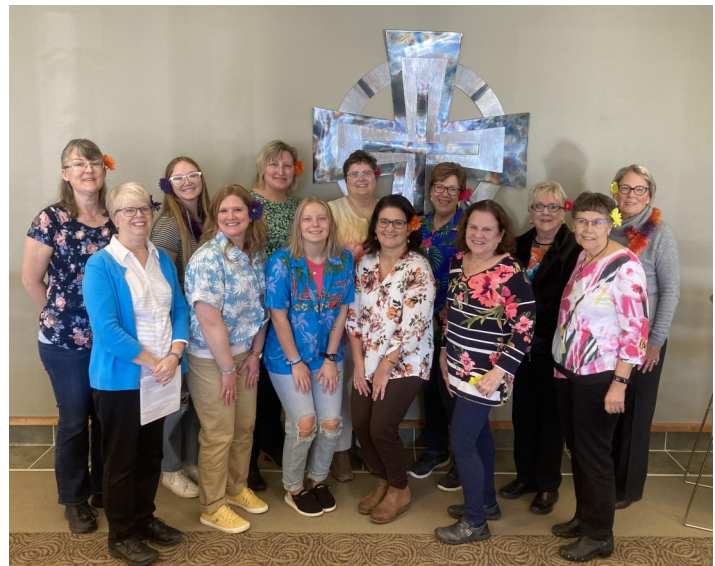
(Handbell Choir pictured above dressed for their Calypso music performance on Sunday, November 20th.)