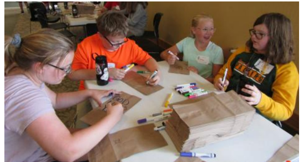
Decorating sandwich bags for the Watertown Sandwich Ministry

Throughout the year, the LCOOR congregation was also involved in outreach in the following areas: