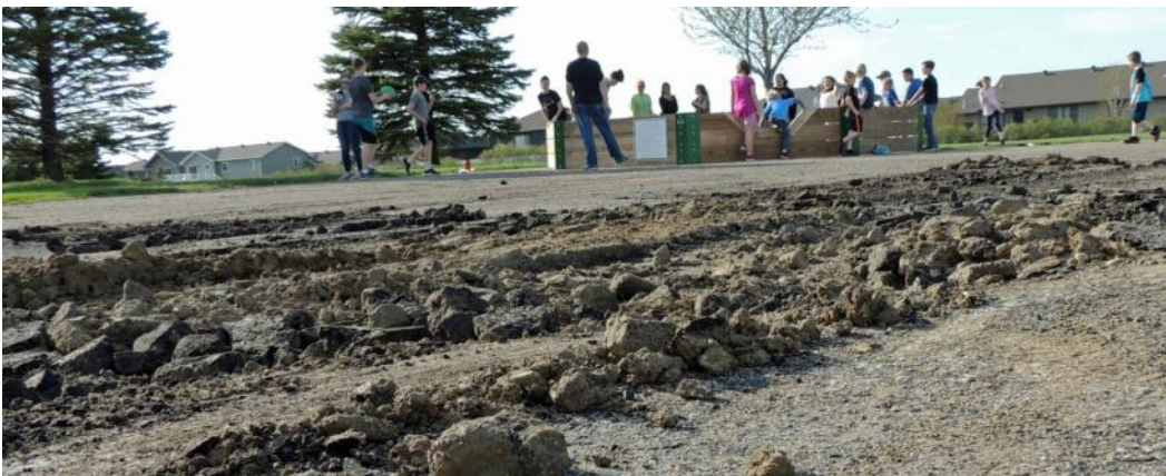
Parking lot after the late spring snow storm

Expenses exceeded income by $16,024.19 on this parking lot because of the unforeseen expense of 28 side-dumps of fill in wet spots. This was needed to provide proper slope for the newly poured concrete. The overate was paid from the Capital Improvement Fund.