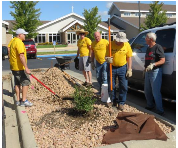
Maintaining the church property during God's Work. Our Hands day.

The Property Committee will continue to keep everyone informed of what is ahead to keep the church a welcoming site.