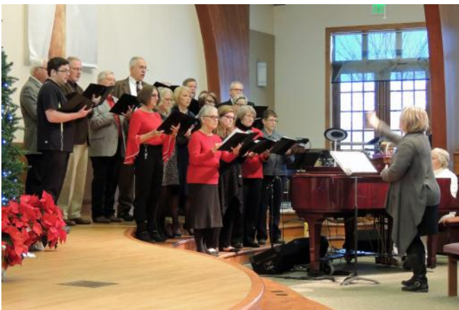
Praise & Rejoice Choir