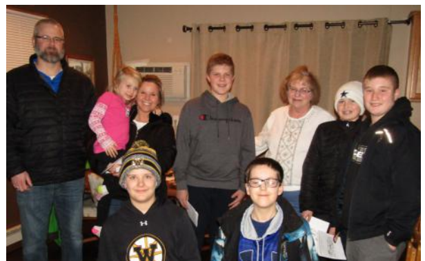
7/8 Grade Christmas Visiting