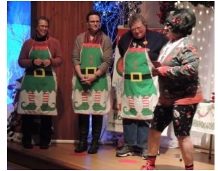
Ladies Night Out

Fellowship Committee – This group organized a variety of events and activities for LCOOR, including serving at a New Member brunch on April 7, 2019. This year's Ladies Night Out on November 11, 2019