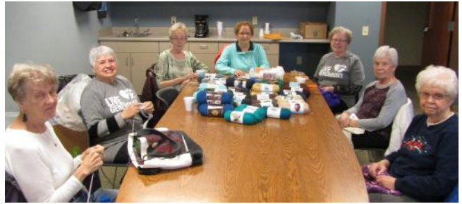
Prayer Shawl Group

Sunday Morning Helpers – This dedicated group makes sure the Lutheran lifeblood (coffee) is ready and waiting for Sunday morning worshippers! They also set out trays of goodies which are appreciated by all ages.