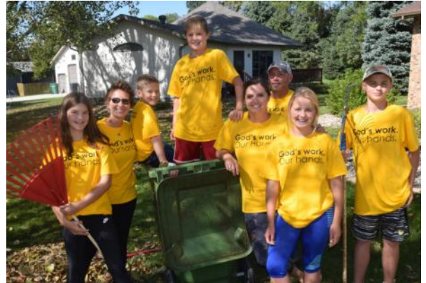
Yardwork Fun during GWOH.

We are very pleased to be represented in the 2019 Parade of Lights and also the Winter Wonderland display at City Park this season. Thanks to the creative families that donated time to build the display, march in the parade and set up at City Park.