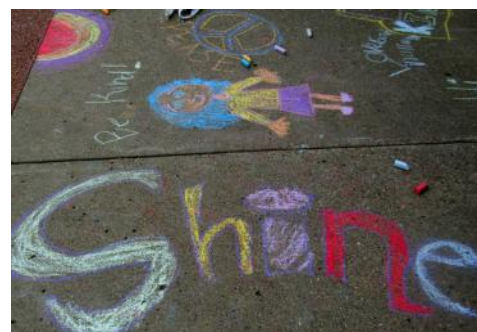
Sidewalk Art on Kemp drawn by our Day Camp Kids