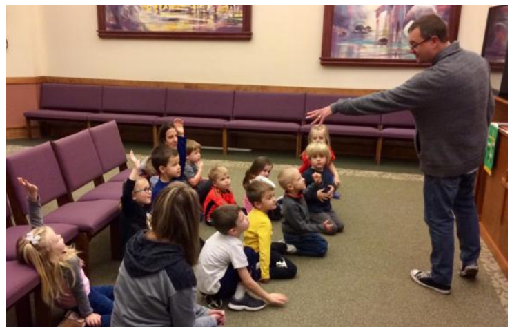
Chapel Time with the Pre-K Students

I am grateful for the ministry that we share. From quilting to prayer shawls to bible studies and book clubs, from Men's Lunch and Women's Circles to Church School to Deeper and Coffee and Conversation, there is always a gathering of people of faith who come to support one another and to be the presence of Christ for one another doing the ministry, the work of the church. This last year we have opened our doors to Watertown Sandwich Ministry so that they have more space to create the meals that are shared three times a week with folks in our community. This is not our ministry alone, but one that is shared with many volunteers from a variety of church backgrounds throughout the Watertown community.