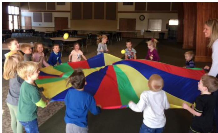
Learning can be so much fun!

We held a winter fundraiser in April where Soulful Creations came in and painted "Champ the dog" with some of our students and church members. Our profit for that was $190.00. For the spring fundraiser we tried something new. We still sold Rada Cutlery which brought in $1,227.85. The other fundraiser we did was the Giving Wall, which brought in $1,680.00 The students sang the first Sunday in April to help kick off the Giving Wall. The amounts earned in the fundraisers were used to further LCOOR preschool. A special thank you to the members of our congregation for your purchases and for your giving. Thank you for your support.