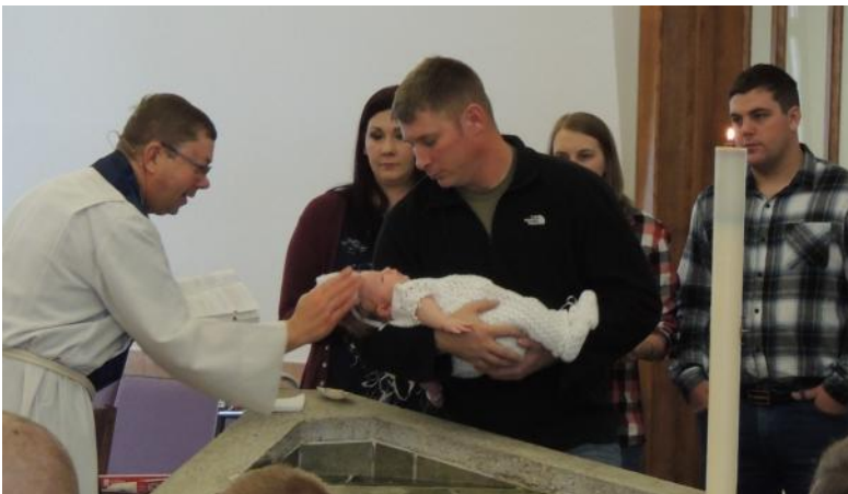
Sacrament of Holy Baptism