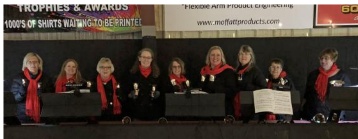
Handbells played at the Watertown Figure Skate Club Ice Show.