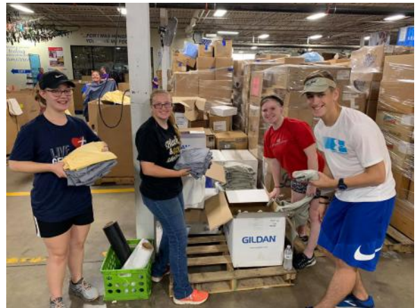
High School Mission Trip Cincinnati, OH