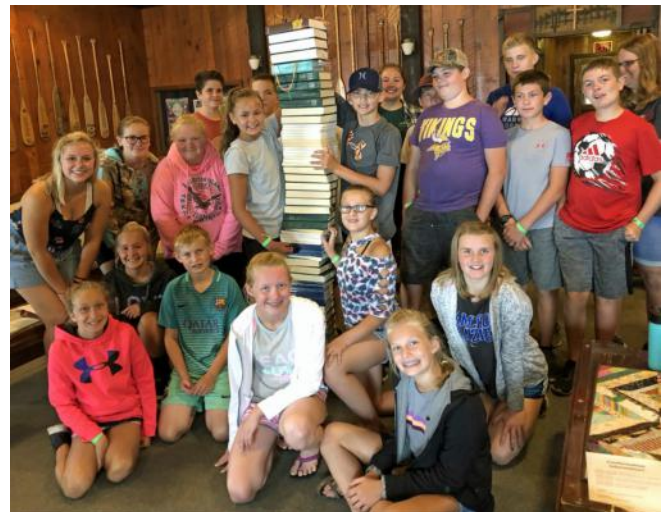
How many books ARE in the Bible? Confirmation Camp at NeSoDak