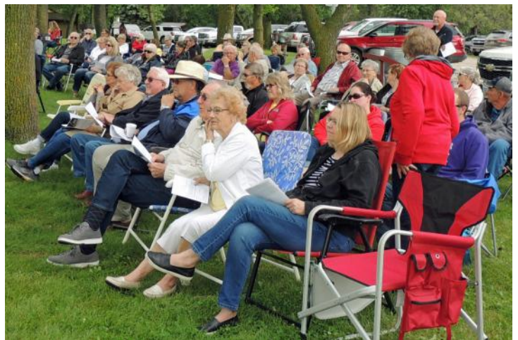
Worship at Memorial Park

The Worship & Music Committee serves in an advisory capacity to, and in partnership with, Lutheran Church of Our Redeemer's pastors and worship leaders.