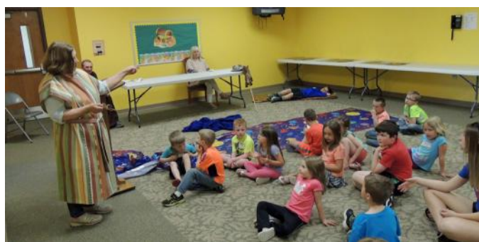
V.B.S. Story Time

VBS was held at the end of May/beginning of June. We had a blast learning & discovering in 2019 with To Mars and Beyond! Ages 4-2nd Grade. Around 100 kids and 50 volunteers!! VBS was held for 3 Nights, (Tuesday, Wednesday, Thursday) from 5:30-8:30pm. Glory to God, who is able to do far beyond all that we could ask or imagine by his power at work within us! Ephesians 3:20. Meals were provided. The children concluded their week with singing for their parents at Closing Worship on the last night! The offering total for the VBS was $357.04 with half the offering going to the Area Pach Program and half to ELCA World Hunger.