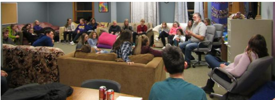
High School Deeper