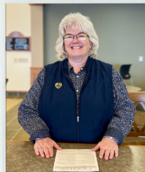
By Twila Schmitt

Let's work together through these coming winter months to keep our spirits bright!