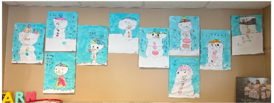
Snowman Directed Drawings