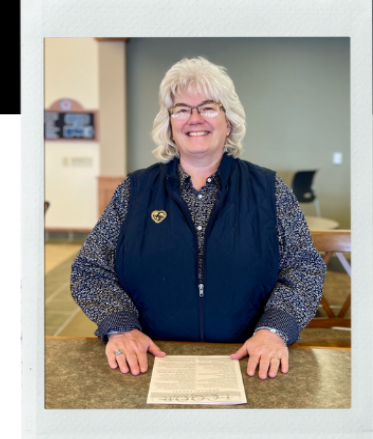
By Twila Schmitt

During the years I've worked here, I've experienced various comfort levels from people asking to be included in the prayers of the church. Some folks don't want others to know what they are going through.