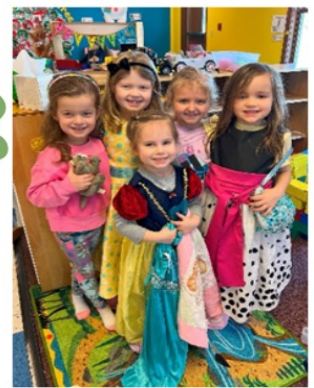
D is for Dress Up