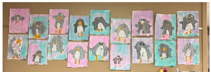
Penguin Directed Drawings