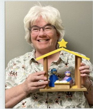
By Twila Schmitt

During our recent “Advent Tour of Nativities” at LCOOR, members and friends of our church family brought in just over 100 nativity scenes to be displayed and enjoyed in the Great Hall. While the stables and figures were awe-inspiring, it was honestly the stories behind them that made the event so memorable for me.