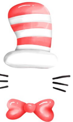
Dr. Seuss Fun!!